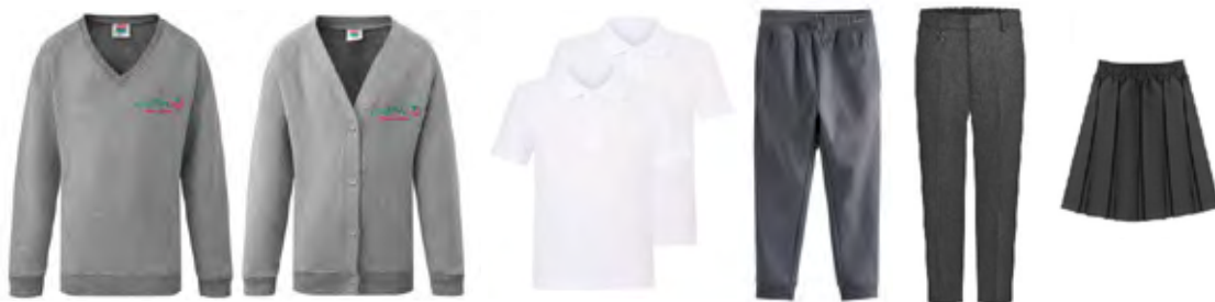
Grey jumper/cardigan with school logo

Please bring a full change of clothes in a drawstring bag for your child. This bag will stay at school.