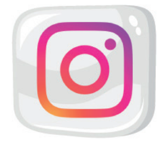
Kingfisher Hall Academy